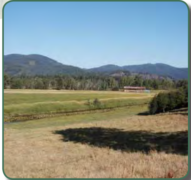
Farmland before wetland restoration

In April 2006, EPA used settlement monies to purchase a perpetual conservation easement that allows for remediation and restoration of a functional wetland to create a clean waterfowl feeding habitat. Remediation of the nearly 400-acre easement area southwest of Cataldo, Idaho, was phased starting with the smaller East Field and followed by the larger West Field. Remedial designs were developed using a team approach involving EPA, the property owner and the Coeur d'Alene Basin Natural Resource Trustees. The design and planning process included substantive compliance with the Clean Water Act Sections 401 and 404, National Historic Preservation Act, and Native American