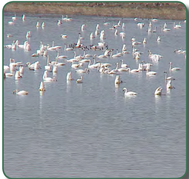
Tundra swans feeding in the clean wetlands following Superfund remediation and restoration by the Natural Resource Trustees.