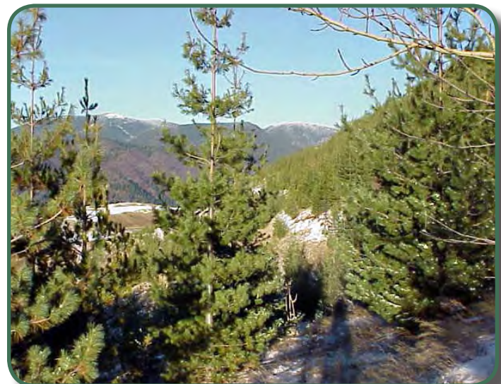
2014 Hillside vegetation growth