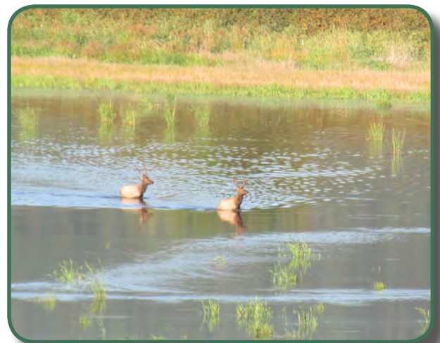
Other wildlife such as bull elk also use the remediated wetlands.