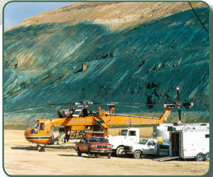
Hillsides aerial hydroseeding ~1998